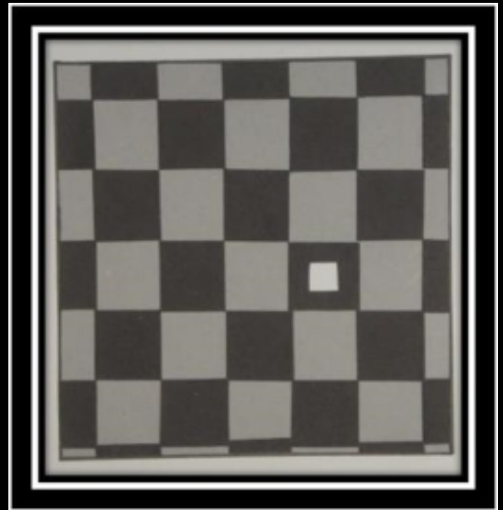
Contrast of Size & Value