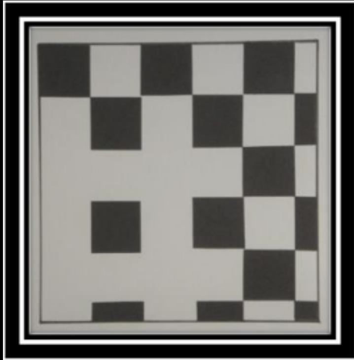
Contrast of Alignment & Shape