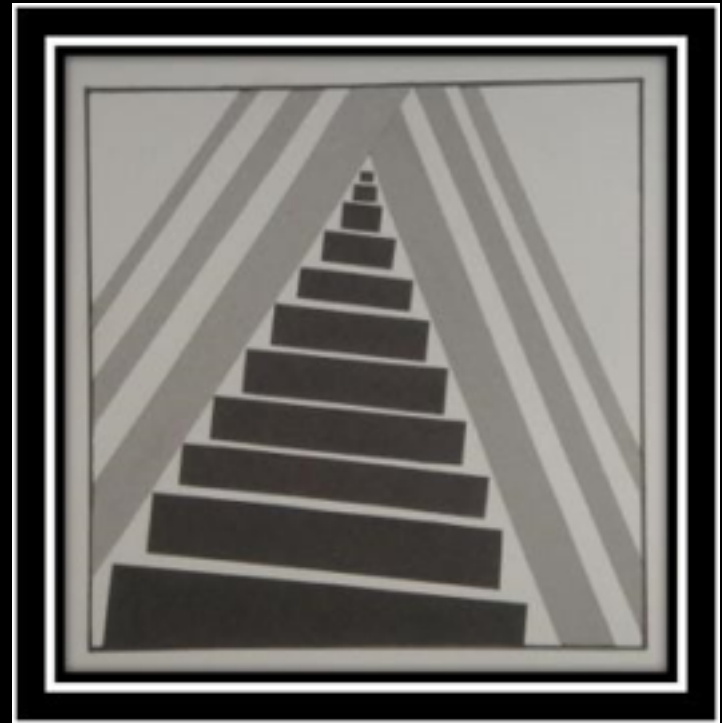
Contrast of Direction & Value