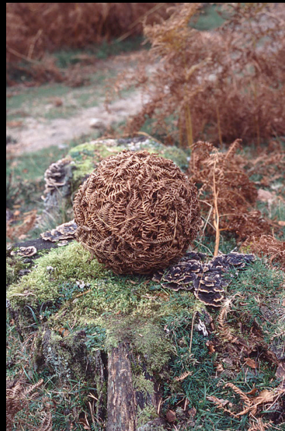
Andy Goldsworthy - Woven bracken ball, Langholm, Scotland, November 1985