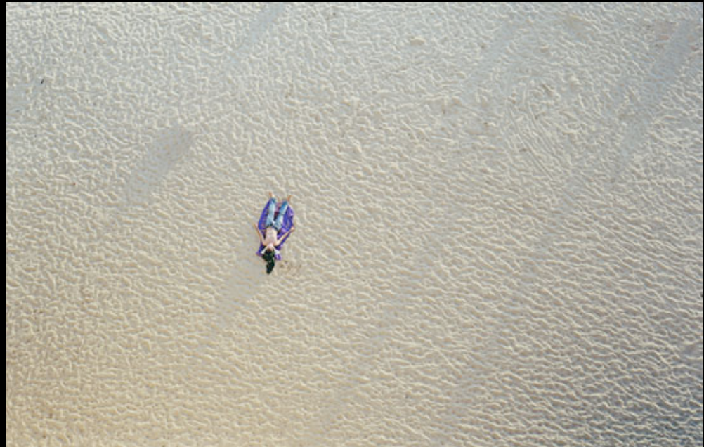
Richard Misrach - Untitled #704-03 from On The Beach, 2003.