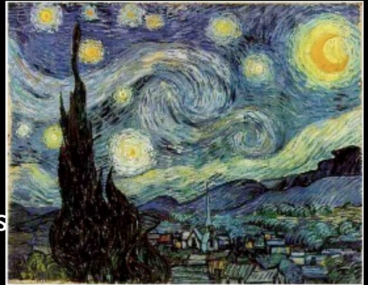
Vincent van Gogh: Starry Night

These transitions are produced by lines, shapes, shape edges, motifs that make them relate to each other.